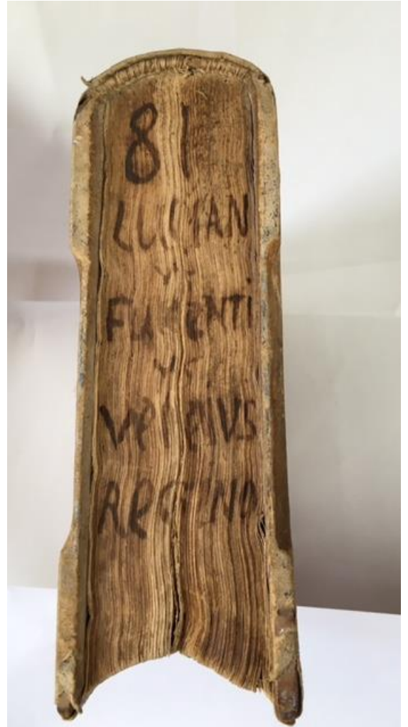
Taglio inf., cop. CCLA, 20160403